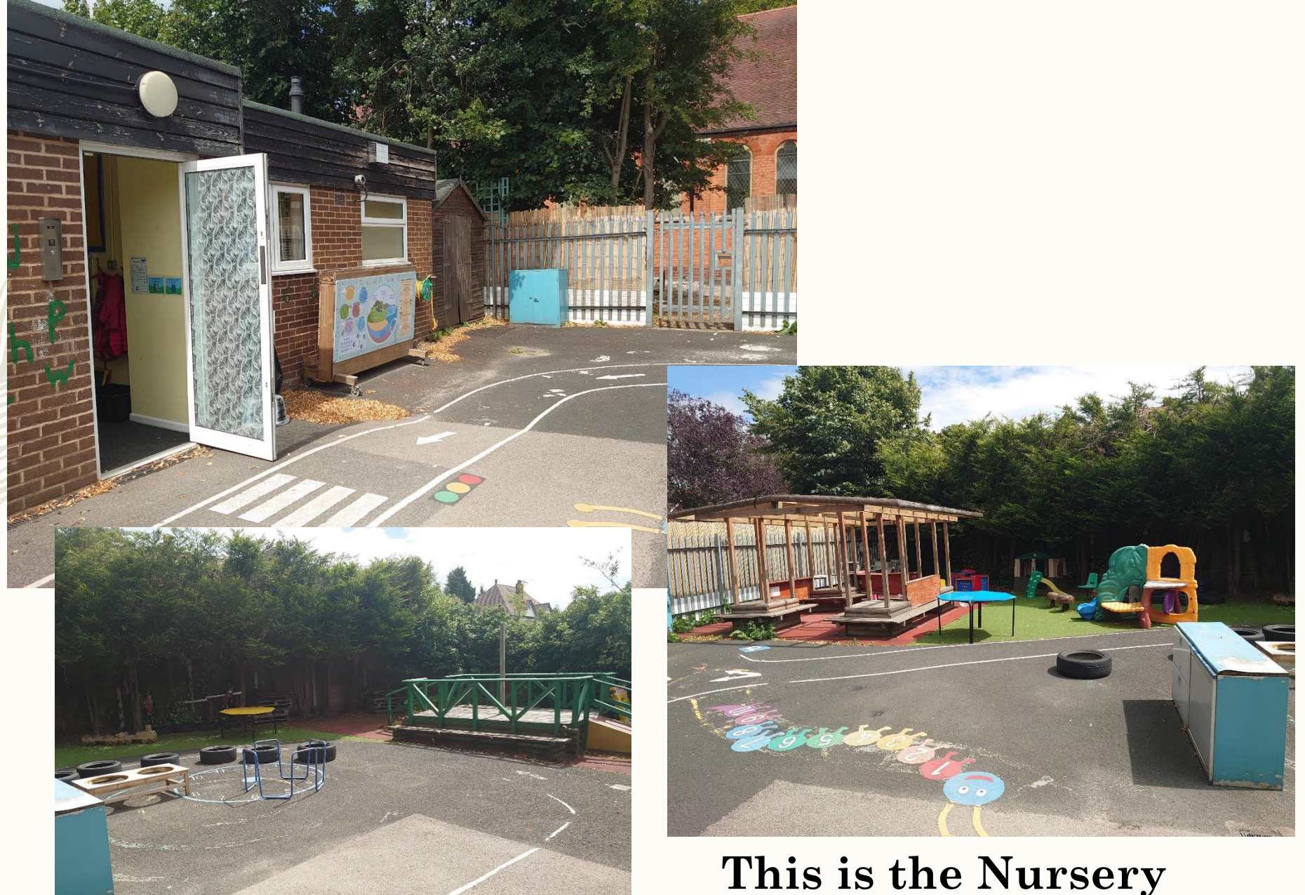
This is the Nursery outdoor area.

Due to COVID, parents are currently not permitted on site.